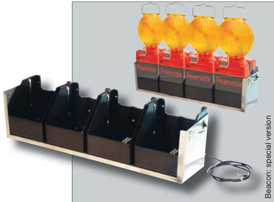
Beacon: special version